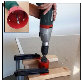
Opening using a hole saw