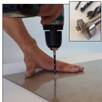
Corner relief drilling using a wood drill with a centring tip