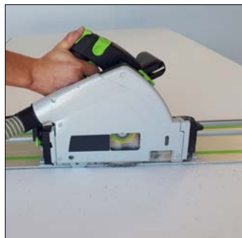
Hand-held circular saw cut

Recommended saw blade: employ saw blades with a tooth pitch of 1.2 to max. 2.5 mm. (coarse metal saw blade / fine wood saw blade / preferably PMMA saw blades).